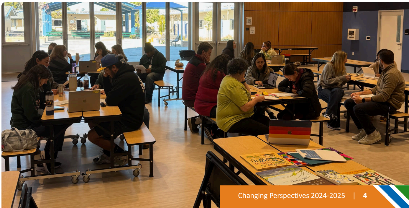
Professional Development, George Hall Elementary School

— — — — — ” — — — — — MIDDLE SCHOOL PRINCIPAL LIPMAN MIDDLE SCHOOL